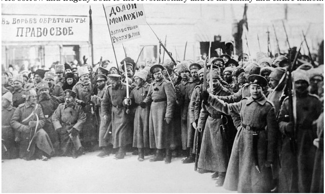
Inscriptions on the placards - 'In the struggle you will attain your right, 'Down with monarchy. Long live the Republic'

Orthodox Christianity teaches that a person finds happiness and meaning only in God. Such a life has a positive effect on a person, his family and in fact the state he lives in. But this ideal can be replaced with the notion of service to another god, in this case, revolution. Devoting one's life to revolution might at first bring a degree of satisfaction, but in the end delivers sorrow and tragedy both to the revolutionary and to his family and entire nation.