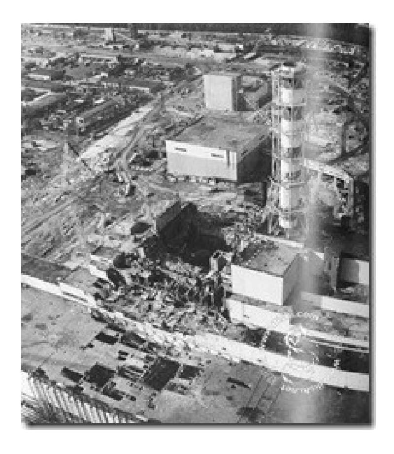
[12] And the fourth angel sounded, and the third part of the sun was smitten,