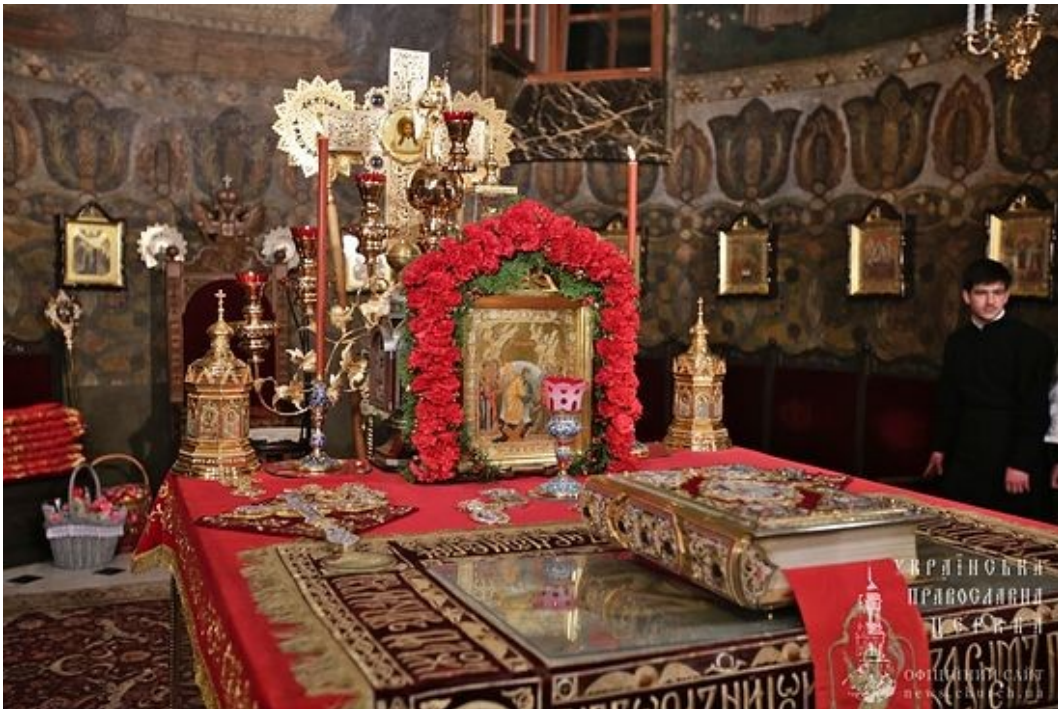
The core of the faith

How were simple fishermen able to spread the news of the Resurrected Christ throughout the whole world? Why do we not bury the dead on Pascha? Do we have to fast before Communion during Bright Week? His Beatitude Metropolitan Onuphry speaks on these and other issues in this interview.