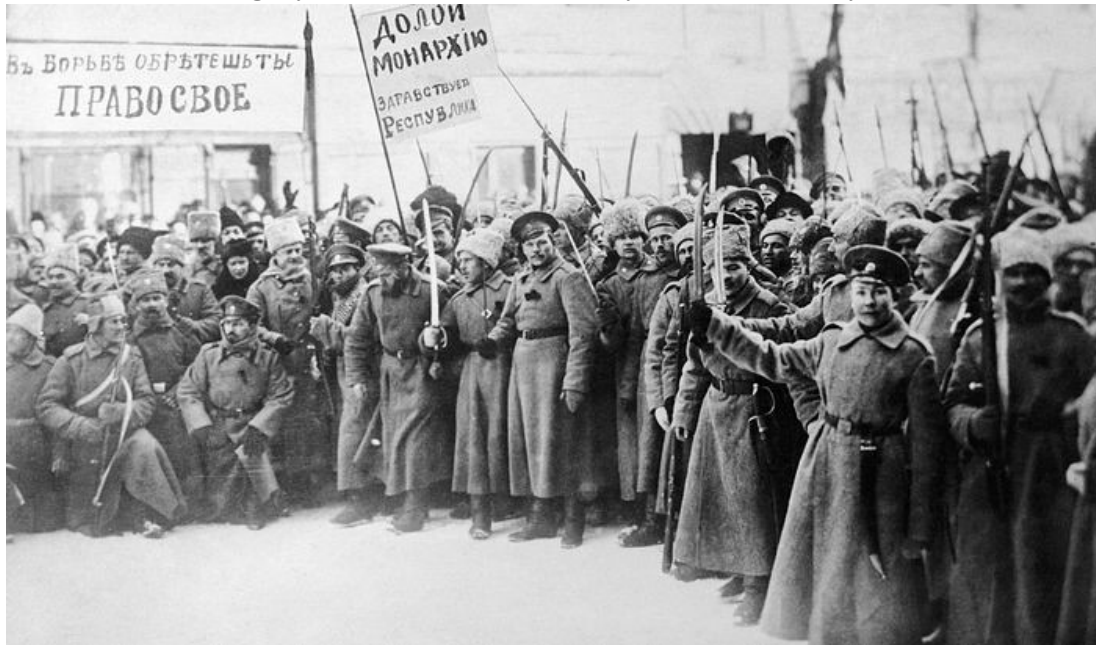
Inscriptions on the placards – 'In the struggle you will attain your right, 'Down with monarchy. Long live the Republic'

Orthodox Christianity teaches that a person finds happiness and meaning only in God. Such a life has a positive effect on a person, his family and in fact the state he lives in. But this ideal can be replaced with the notion of service to another god, in this case, revolution. Devoting one's life to revolution might at first bring a degree of satisfaction, but in the end delivers sorrow and tragedy both to the revolutionary and to his family and entire nation.