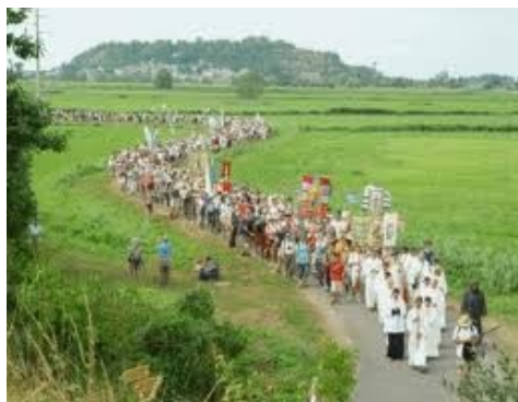
Pilgrims in Brittany Today