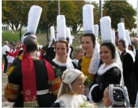
Breton Women in Costume

Vannes: St Paternus (Patern) was not from Wales, but a fifth-century Gallo-Roman who became Bishop of Vannes, reposing before 500.