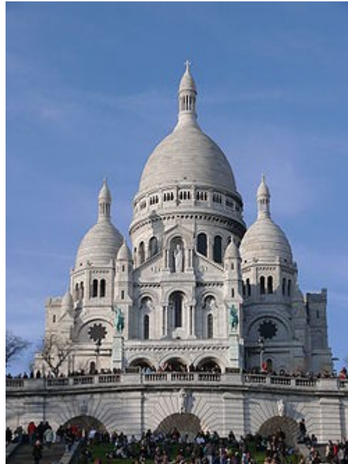
Sacre Coeur, Paris

A third candidate for the finest building in the world might be the nineteenth-century Sacre Coeur basilica in Montmartre in Paris.