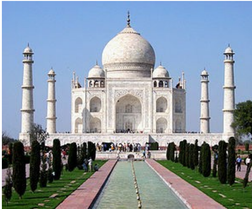
The Taj Mahal

What is the most beautiful building in the world?